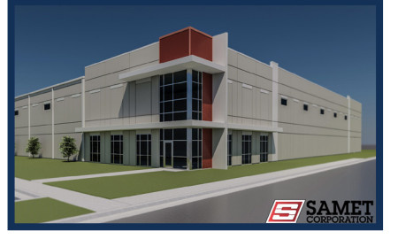
OMNI INDUSTRIAL PARK - SAMET BLDG 3 Summerville/Jedburg ±126,687 SF Available