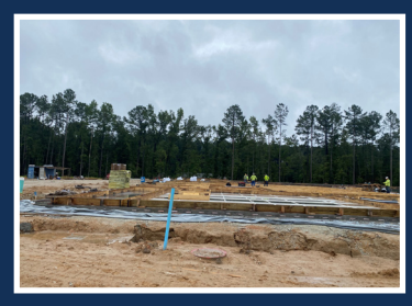
OMNI SAMET ±127,000 SF