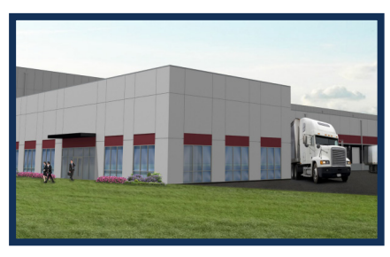
FREEZER/COOLER STORAGE Ridgeville ±273,803 SF Available (Expandable)