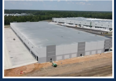
TRADE PARK EAST BLDG 1 & 3 ±516,000 SF