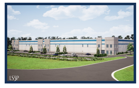
1014 NORTHPOINTE INDUSTRIAL BLVD Hanahan/N. Rhett ±127,199 SF Available