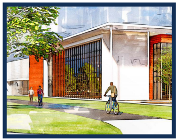
HUB@NEXTON Summerville 30,000 SF Available