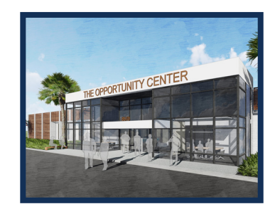
OPPORTUNITY CENTER North Charleston 9,410 SF Available